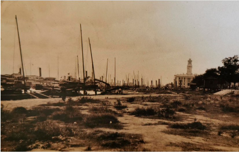
Illustration 2 Ships and docks near Jiangnan Customs in Hankou in the 1920s

the contract. Such loss of time and energy could also be regarded as an additional transportation expense, which led to the reduction in, or even complete loss of the commercial profits of traders. 32