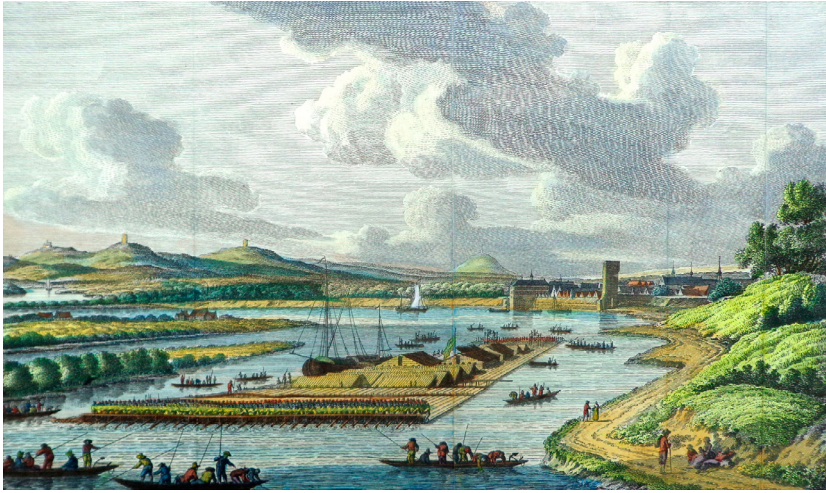
Illustration 1 Wood raft on the Rhine near Bonn (source: colored copper engraving by J.E. Grave, after a model by J. Bulthuis, 1796 Siebengebirgsmuseum, Königswinter, Germany.)

The considerable revenues from the Dutch timber trade not only compensated the negative balance of payments with the Netherlands and – together with other exports – made the import and consumption of colonial goods in western and southwestern Germany possible. 8 They also were invested in other industries and infrastructure, which is why the question arises as to what long-term consequences the Dutch timber trade had for the economic development of the economic regions involved. Thus, in addition to the classical problem of the source of investment capital for the industrial enterprises of early industrialization – and also in reference to Haupt’s cold heart – the question also comes up as to whether and to what extent capitalist practices and attitudes spread in the German hinterland through the Dutch timber trade, and from which social classes the actors in this timber trade came.