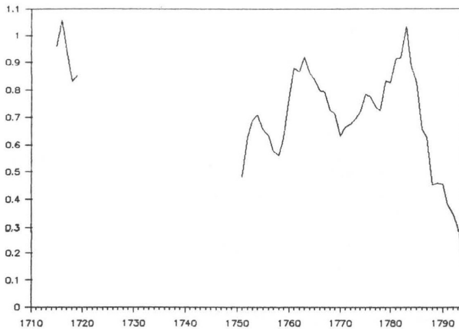
Figure 2 The amount of timber rafts registered at the Schenkenschans toll in million square feet 1710-1796 11