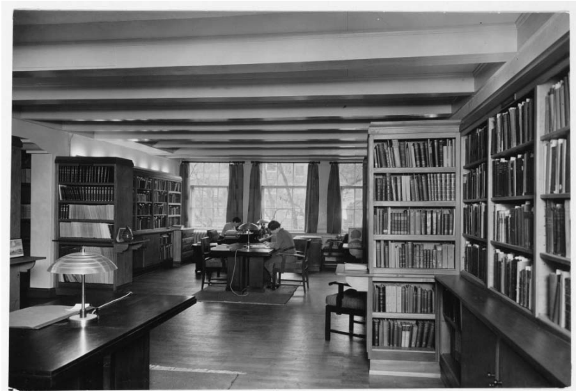
Economic History Library, Amsterdam. View of reading room on the first floor, ca. January 21, 1933.

Some of the more impressive acquisitions – such as a tulip book 8 (early seventeenth century), Japanese prints (early nineteenth century), coins and medals and price lists – were made possible partly by members making extra payments into the Book Fund, which had been established in 1927. 9 This Book Fund could be regarded as the result of a type of crowd funding (before the term existed).