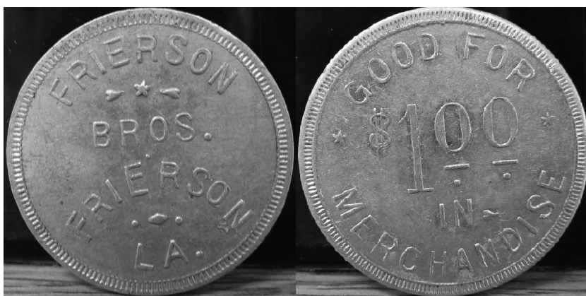
Illustration 2. Plantation token from Lakeview plantation, Frierson Company