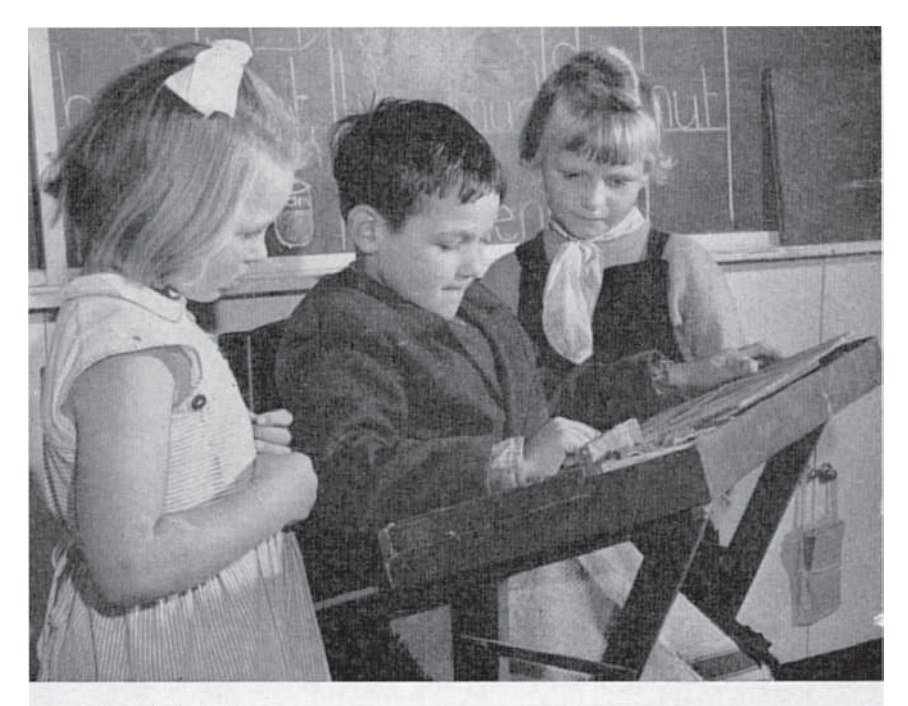
Hun spelen is leren

Nogmaals, het is absoluut noodzakelijk Engels te leren. Doet U het niet dan leeft U letterlijk eenzaam. U kunt dan niet met de onderwijzer over Uw kinderen praten. U hebt geen contact met Uw buurvrouw, U kunt Uw leveranciers niet begrijpen. U kunt geen krant lezen, U begrijpt niets van de radio en U kunt in de kerk een Australische predikant niet verstaan. En als U werkt, loopt U kans dat de beste baantjes Uw neus voorbij gaan, omdat U de taal niet voldoende kent.