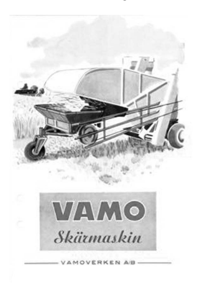
Illustration 1. Marketing illustration for one of Vamo's straw choppers from the early 1950's.

In Kvänum, there has never been any 'Spirit of Gnosjö'. The idea of Gnosjö is that if you can't do something by yourself, then you walk over to your neighbour, and maybe you can do it together. The idea of Kvänum is: mind your own business and don't give a shit about the others.<sup>38</sup>