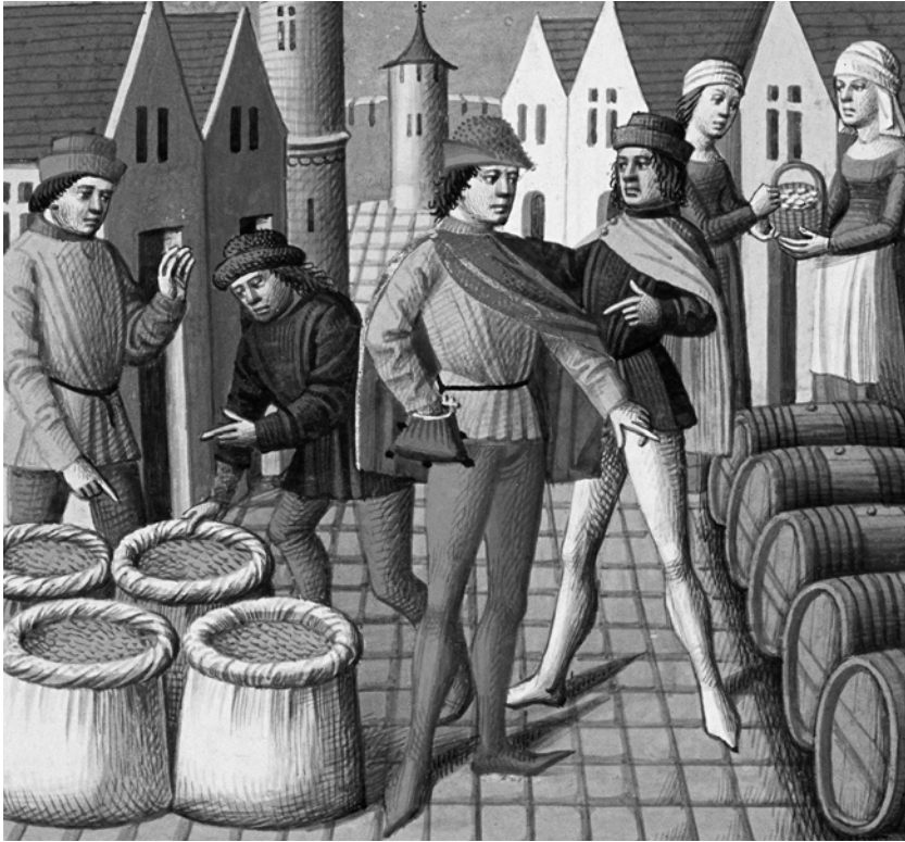
Illustration 1. Fifteenth-century depiction of a grain and wine market. Source: Augustine, La Cité de Dieu I (Paris c. 1475). Illumination by Maître François. (Museum Meermanno (The Hague), Huis van het boek, 10 A 11, fo. 235v.)

government policies themselves also included restraints on internal trade in times of dearth. From the middle of the century, for instance, corn badgers officially required a license from the local justice of the peace. While this prescription may not always have been enforced, the fact that it found its way into the 1586 book of dearth orders – together with some other measures restricting the movement of grain within the country – suggests that in times of distress it did have meaning; and at the end of the sixteenth century those times were frequent. 38 At that stage, then, the internal grain trade, just as the export trade, was in practice subjected to restraints.