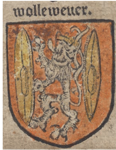
Illustration 3 Coat of arms of the Ghent weavers' craft guild. Detail from Pieter de Keyser, Wapenen vanden edelen porters van Ghendt also zij van hauts tijden in schepenen bouck staen. Hier near volgen die wapenen vanden neeringhen van Ghendt ende die ambachten, 1524.

ly belonged to the commercial elite of the city. 67 According to the contract, Heinric had promised to make the wool into fabric ( 'omme lakene te makene van diere wulle' ) and return the rest of the profit to Jurdaen ( 'ghevende hem dreste' ). 68 The latter had thus arranged for the raw materials and the capital to buy them, but the actual weaving of the cloth was subcontracted to a smaller weaver. Whereas a more ordinary weaver needed wealthy drapers for his economic capital to finance